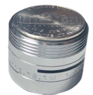
Nickel on aerator

Step 2. Detach the faucet adapter from the diverter.